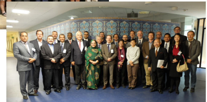
Fisheries Transparency Initiative 2nd Advisory meeting of the FiTI Rome/Italy, 21.10.2015