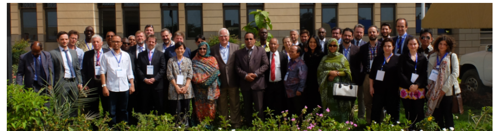
Fisheries Transparency Initiative 3rd Advisory meeting of the FiTI Nouakchott/Mauritania, 04.02.2016